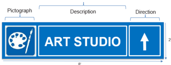
Example of Large Regional Sign: